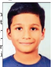
By Our Staff Reporter

He came 1st in 100 meters backstroke, and 3rd in 100 meters butterfly and 200 meters individual medley. He was also part of the team that came 3rd in the 4x100 meters relay. In April, he had got his name entered in the World Book of Records in the paralympic category by swimming across the sea from Thalaimannar to Dhanushkodi in 9 hours and 11 minutes.