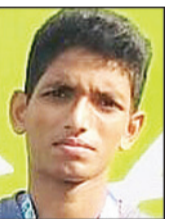
By Our Staff Reporter