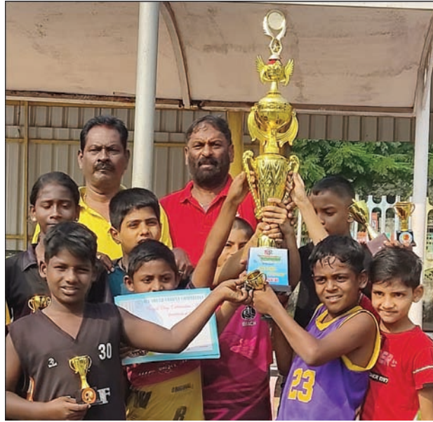
The Under-14 boys' bas-