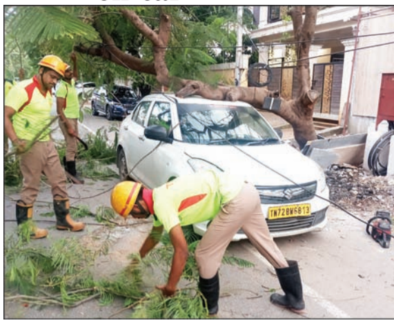
The contact number of the fire station is 90032 01156.

Within an hour, firemen from JJ Nagar fire station cut and removed the branch.