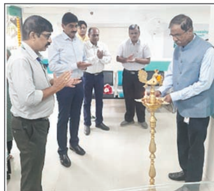
Medivision Annanagar Branch Inaugurated by