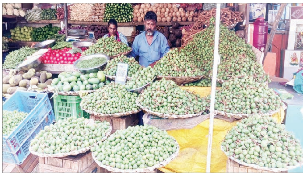
By Our Staff Reporter

'Vadumaanga' and watermelon signal the arrival of summer. 'Vadumaanga' is especially popular among the Brahmin community. A number of vendors were seen selling the tender mangoes on Station Road, West Mambalam.