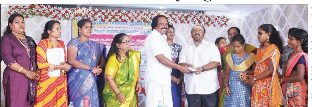
By Our Staff Reporter

AAVIN Women Welfare Society (Pasumpon Muthuramlingam Devar Salai, Nandanam) celebrated International Women's Day with donations last week.