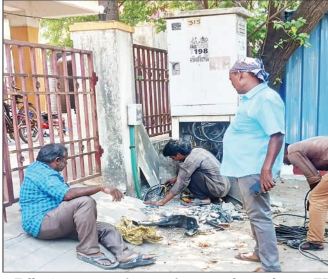
Following outage of power for more than 6 hours, EB workers were seen replacing a portion of the damaged power cable connecting two pillar boxes on Kothandaramar Temple Street (West Mambalam). The photo was taken at 2 p.m on March 13.