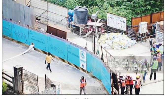
By Our Staff Reporter

Pedestrians are having a tough time on narrow stretches of roads where Chennai Metro work is in progress.