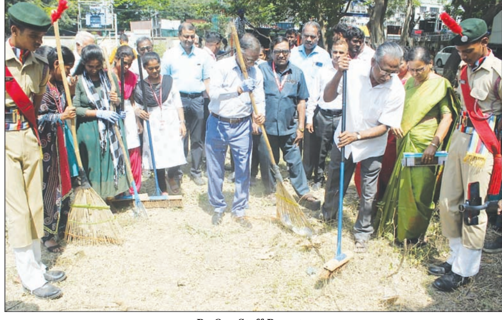
By Our Staff Reporter

More details can be had in 2814 3896 and 2814 3514.