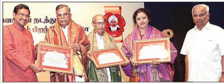
By Our Staff Reporter