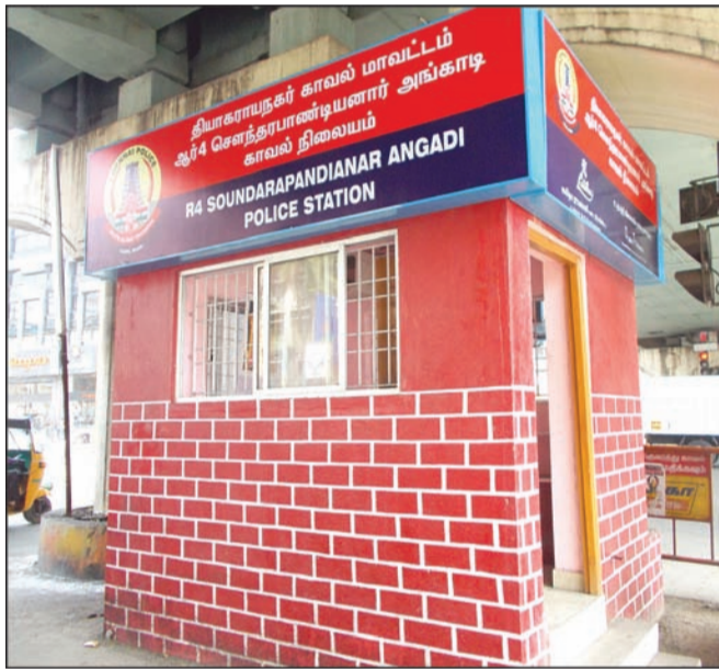
By Our Staff Reporter R4 Soundarapandianar Angadi Police Booth was con-

structed two months ago under the G. N. Chetty Flyover, T. Nagar but electrical work is yet to be completed.