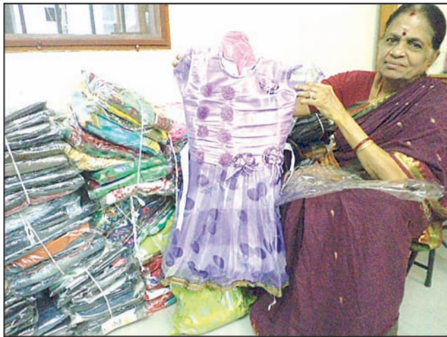
Thirumazhisai and other ar- ing in cash/kind may contact eas. Those interested in donat- phone 98417 65222.

Chennai, Villupuram, Madu- rathakam, Chengalpattu,