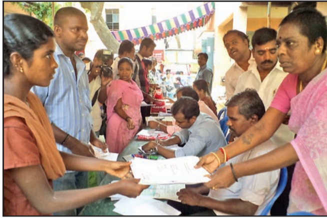
balam Times that Tahsildhar (Mambalam-Guindy Taluk) along with other staff participated in the program, examined the documents and issued the certificates.