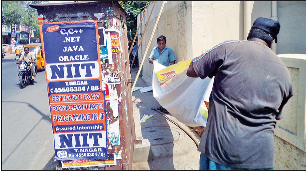
By Our Staff Reporter

Chennai Corporation workers removed the unauthorised hoardings erected on the pavement and the vinyl banners affixed to the lamp posts on Duraisamy Road, T. Nagar, a couple of days ago.