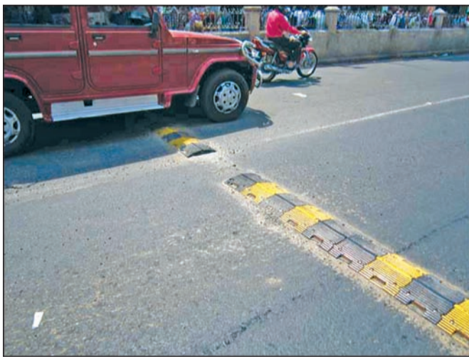
By Our Staff Reporter

The synthetic speed breaker installed a couple of months ago on Usman Road, near Ranganathan Street, T. Nagar, is broken in a couple of places.