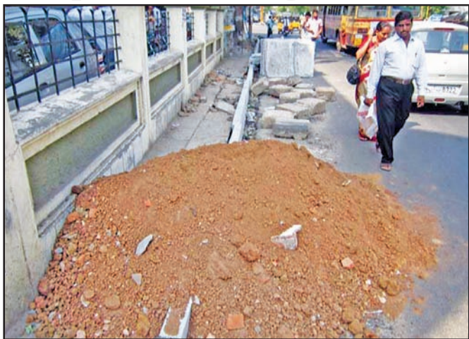
The damaged pavement on Butkit Road (T. Nagar) is being re-laid.