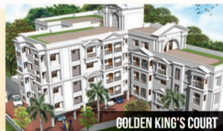
GOLDEN KING'S COURT