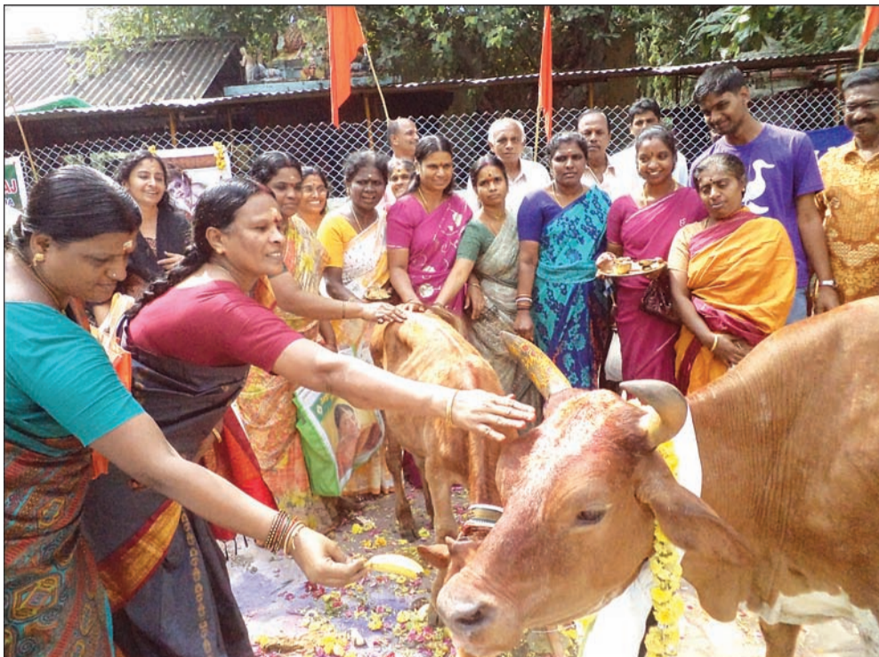
Organization of medical camps and spiritual programs are among other activities, he added. More details can be had in phone 98847 04497.

Bhagawad Gita classes are conducted on Sundays.