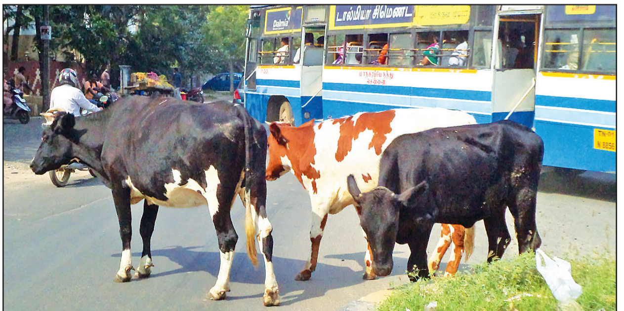
By Our Staff Reporter Stray cattle on 11 th Avenue, Ashok Nagar hinder movement of vehicles and other road users.