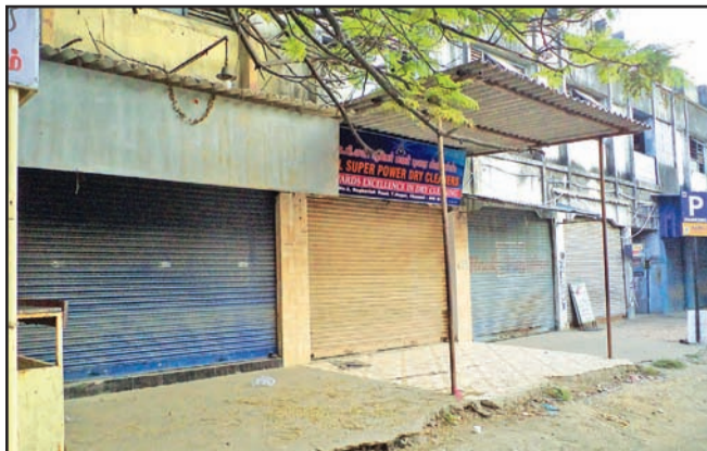
A number of shops in the neighbourhood were found closed for Pongal on Jan. 14.