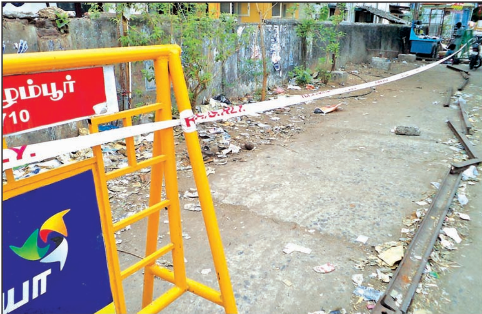
By Our Staff Reporter

Following strict action taken by Mambalam Railway Protection Force, parking of vehicles in the 'No parking' area on the west side of Mambalam Station reservation office has come down. RPF personnel have placed barricades with reflector tape in the no parking area. They are also collecting Rs. 200 as fine from offenders.