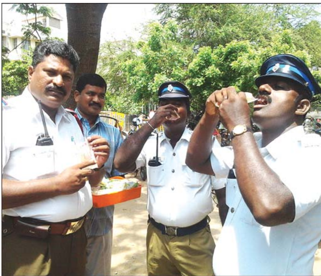
By Our Staff Reporter

Policemen regulating traffic under the hot sun are being provided buttermilk and fruit juice 4 times in a day following orders given by Chief Minister J. Jayalalithaa.