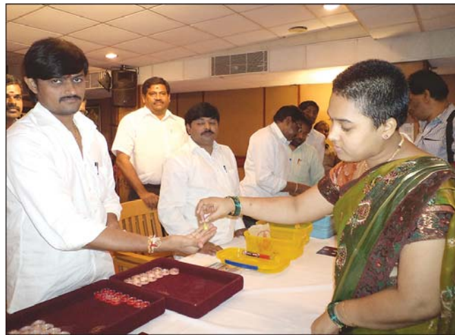
By Our Staff Reporter

Hundreds of persons bought gold/silver dollars embossed with the picture of Lord Venkateswara from TTD Information Center, Venkatanarayana Road, T. Nagar on Akshaya Trithiya Day on April 24.