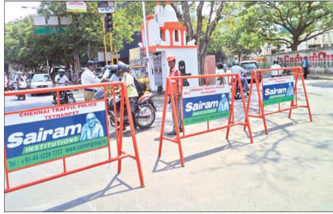
Entry is barred into G. N. Chetty Road from its junction with Sunder Street. The one-way on Sunder Street has been reversed with entry from G. N. Chetty Road side.

The new changes include a dedicated lane for MTC buses from Eldams Road traffic sig-