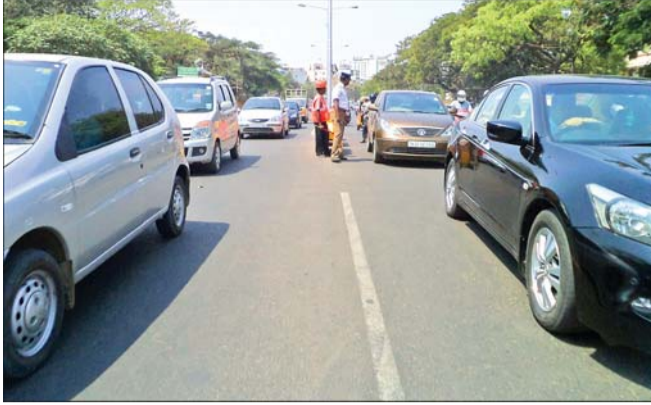
The stretch of G. N. Chetty Road which has been made one-way.

The second phase of traffic diversion on Anna Salai to facilitate work on the Metro Rail project, which came into effect on Saturday, March 24, caused a great deal of confusion among motorists.