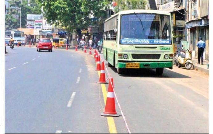
The dedicated lane for MTC buses.

This, some MTC officials feel, could be a precursor to a bus rapid transit system (BRTS) in the city. "This is will defi-