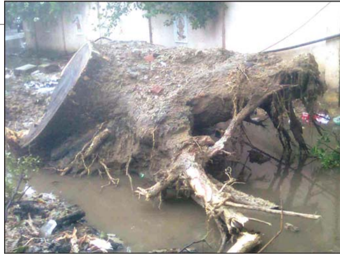
A tree on Coats Road in T. Nagar, which was uprooted in strong winds on Dec. 29, fell on a parked car.