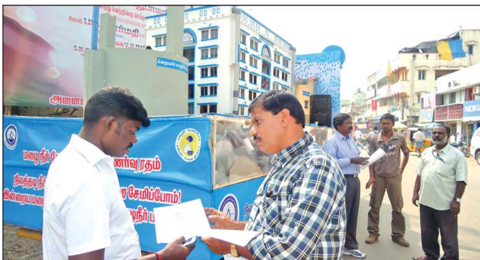
By Our Staff Reporter

Metrowater Board has launched a campaign to popularize rain water harvesting. Workers of the board visit chosen areas to demonstrate techniques and distribute pamphlets among residents.