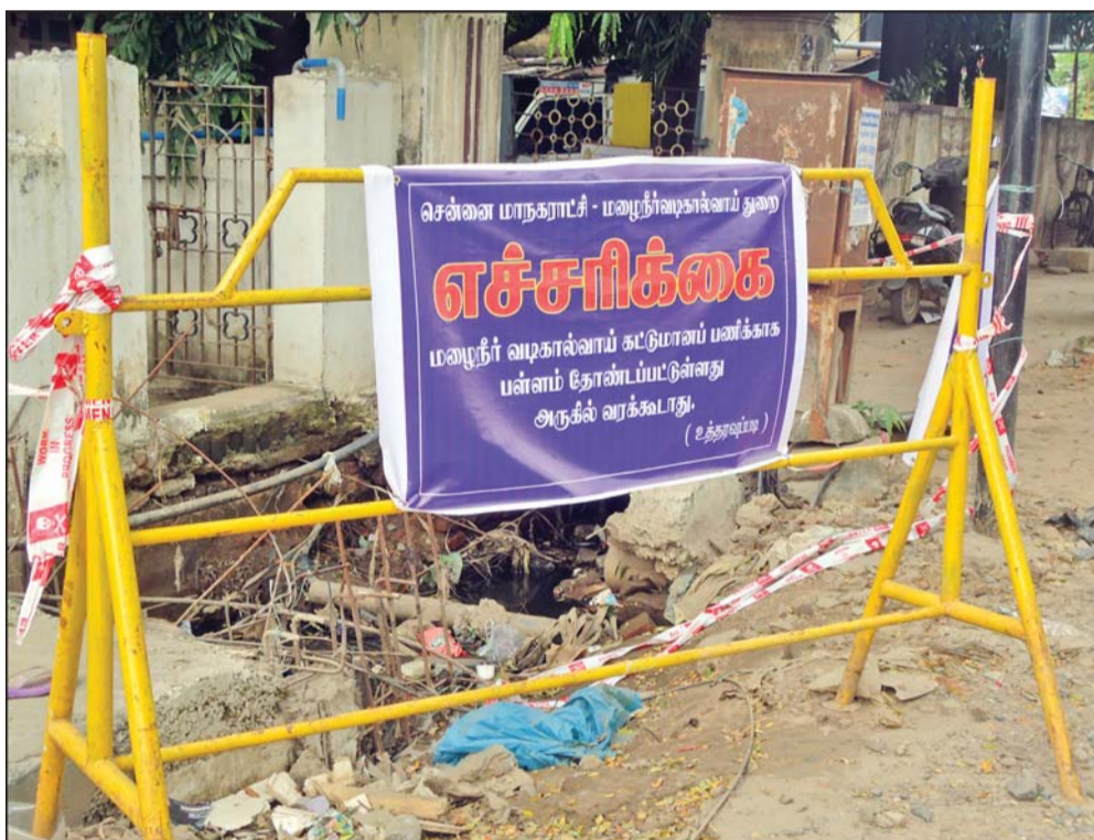
Cautionary sign installed near a trench in North Usman Road

By Our Staff Reporter M. Sarala (24) (resident of 5, Anna 1 st Street, MGR Nagar) fell into a water-filled trench dug for a stormwater drain at the junction of Krishna Street and North Usman Road in T.