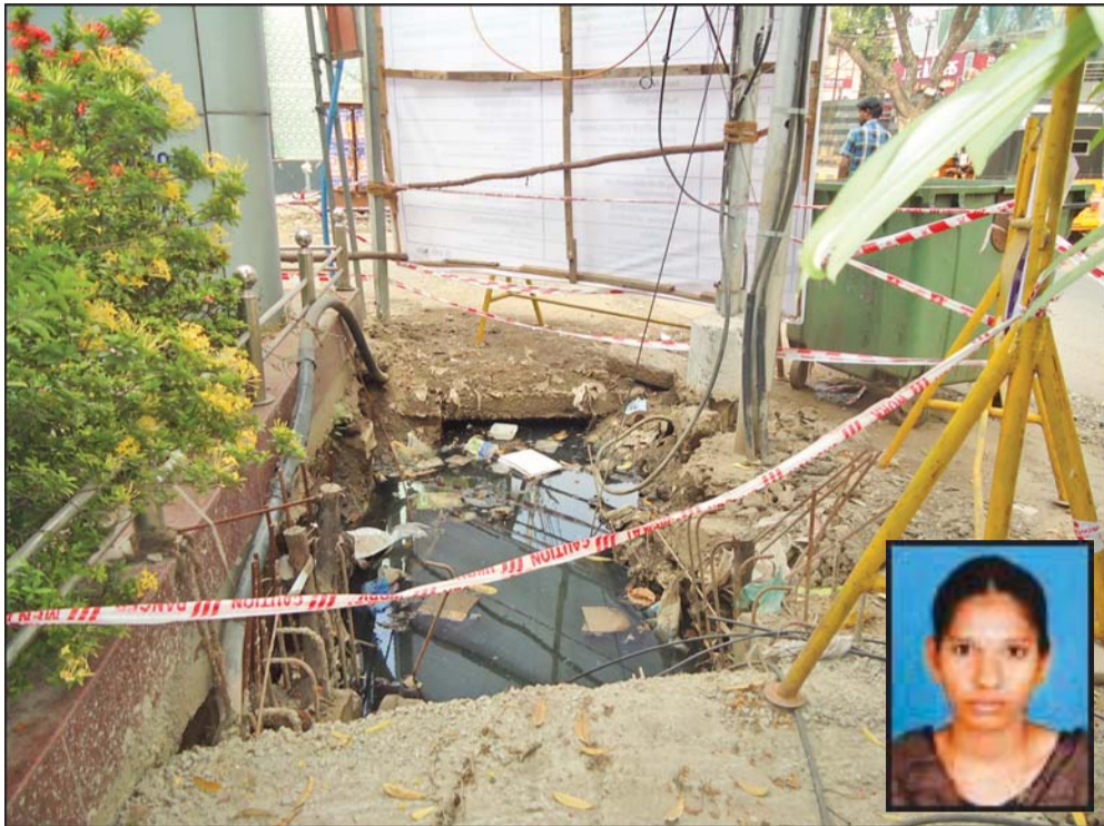
The trench in which Sarala died