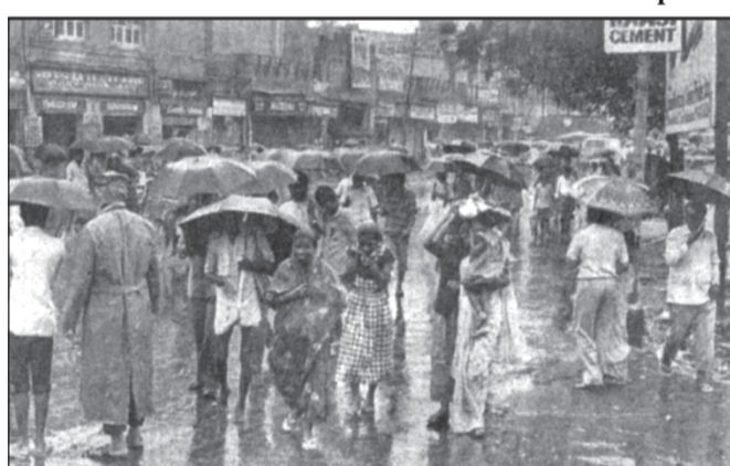
South Usman Road in T. Nagar, Madras as it looked on a rainy day on November 7, 1988

Pondy Bazaar began to make its appearance. It was initially known as Soundarapandia Bazaar after Justice Party politician W. P. A. Soundarapandian Nadar.