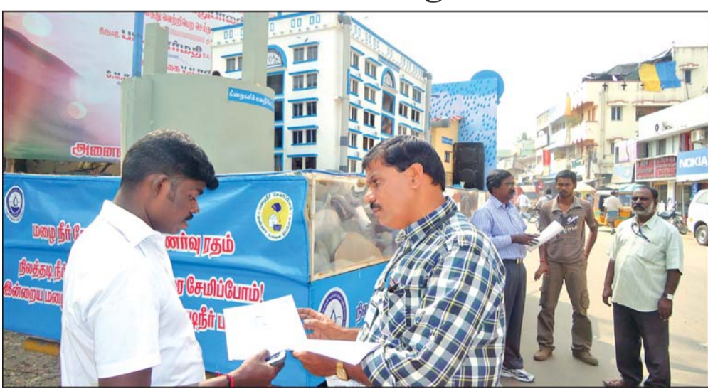
By Our Staff Reporter

Metrowater Board has launched a campaign to popularize rain water harvesting. Workers of the board visit chosen areas to demonstrate techniques and distribute pamphlets among residents.