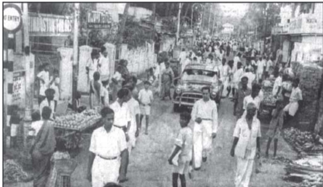
A view of the evening market on Station Road in 1962