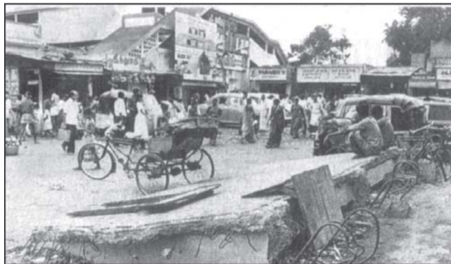
A scene in T. Nagar opposite the Mambalam Railway Station after a spell of rain in September 1986

Until the turn of the 19 th century, the villages to the west of Mount Road formed a part of Chingleput District.